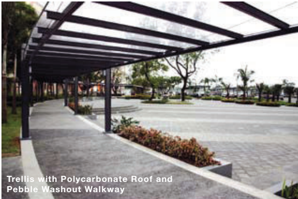
Trellis with Polycarbonate Roof and Pebble Washout Walkway