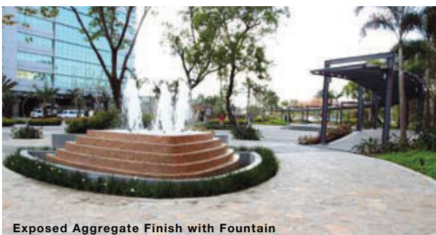
Exposed Aggregate Finish with Fountain

The Park is the heart of the landscape. It was incorporated with a 500 meter lagoon, which adds a different experience to the atmosphere. People can interact with the water, the fishes or just hang out in the pavilion while loosening up to the entire view of the surrounding. It also mirrors the water body from the other side of the boulevard highlighting its entry. Another element is the modern trellis which covers the walkways across the park. It was strategically placed to provide a comfortable walking experience; and a buffer for the lagoon and the garden, and into the main field. Cypress Bomanite installed the softscape with primary consideration on the existing trees while making sure that the years-old trees are preserved. Meanwhile, the shrubs are laid out in way that a garden is achieved on one side and a corporate landscape is attained on the other. These are also arranged so they are not just good to look at while also be functional. There is also an open area to accommodate large crowd. To ensure that the pavement's quality can hold even high traffic of people while not losing its beauty, stamped concrete of Bomanite were applied. "The landscape material selection