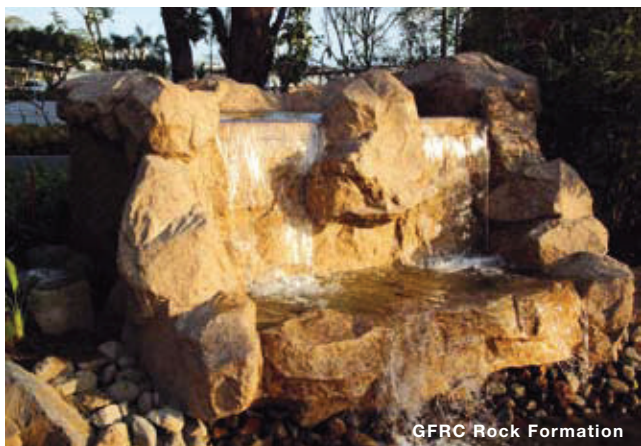
GFRC Rock Formation